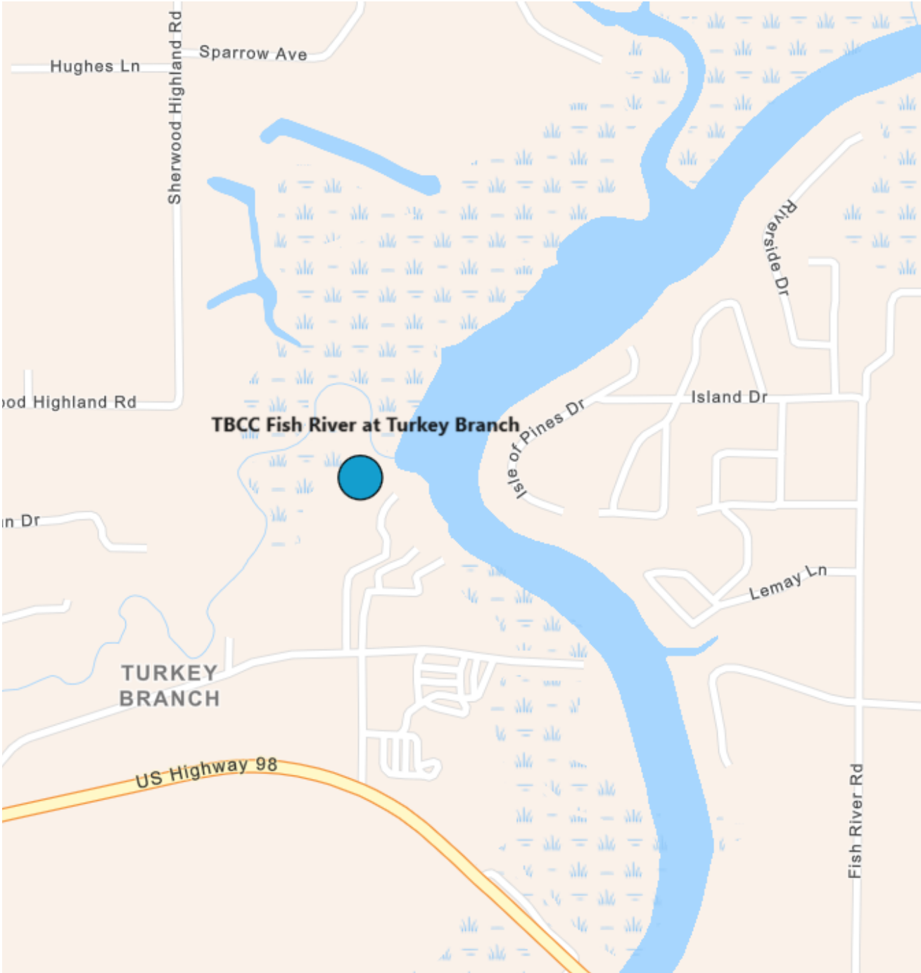
The testing site in Fish River at "Turkey Branch" is located near the blue circle.