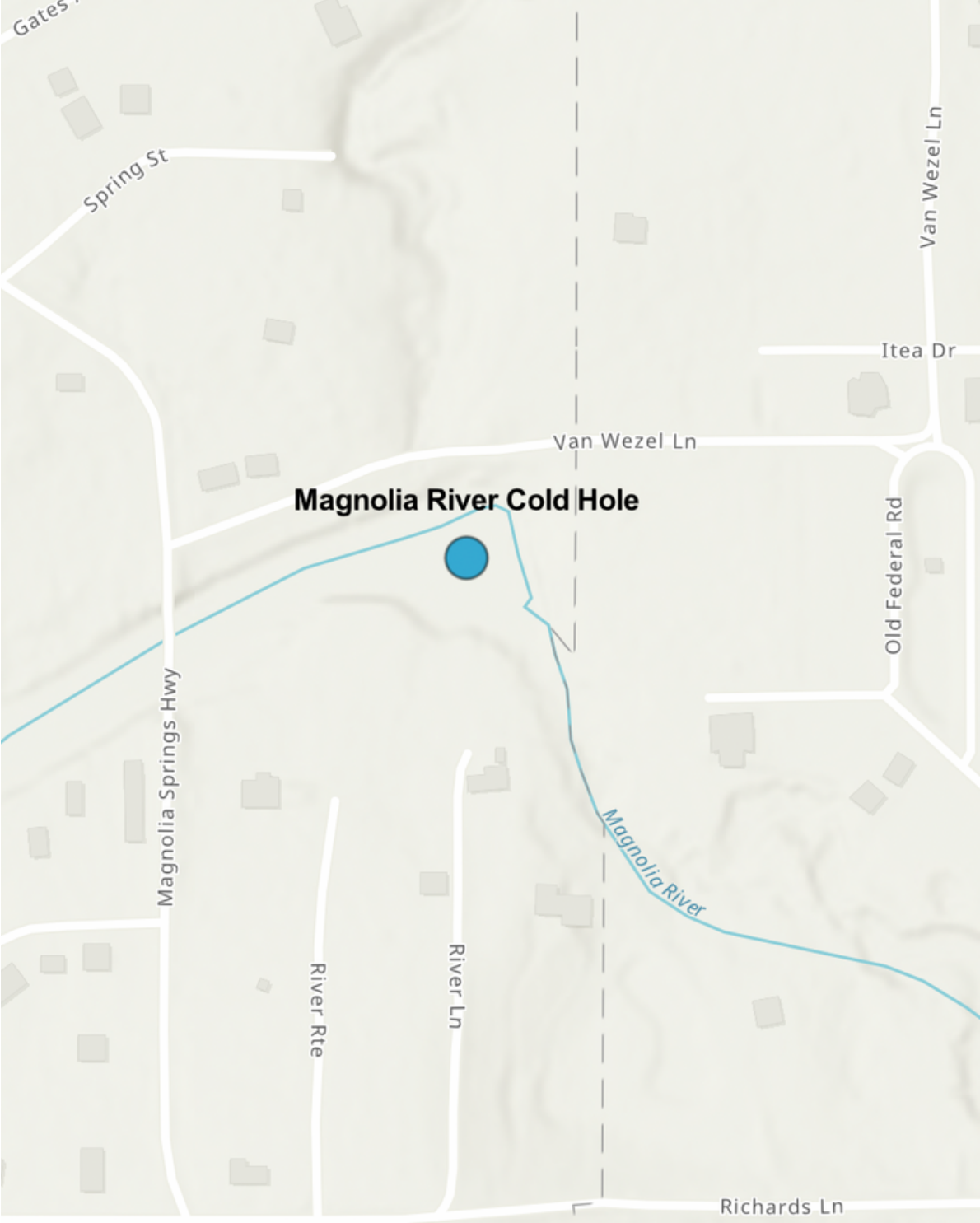
The testing site in Magnolia River at "Cold Hole" is located near the blue circle.