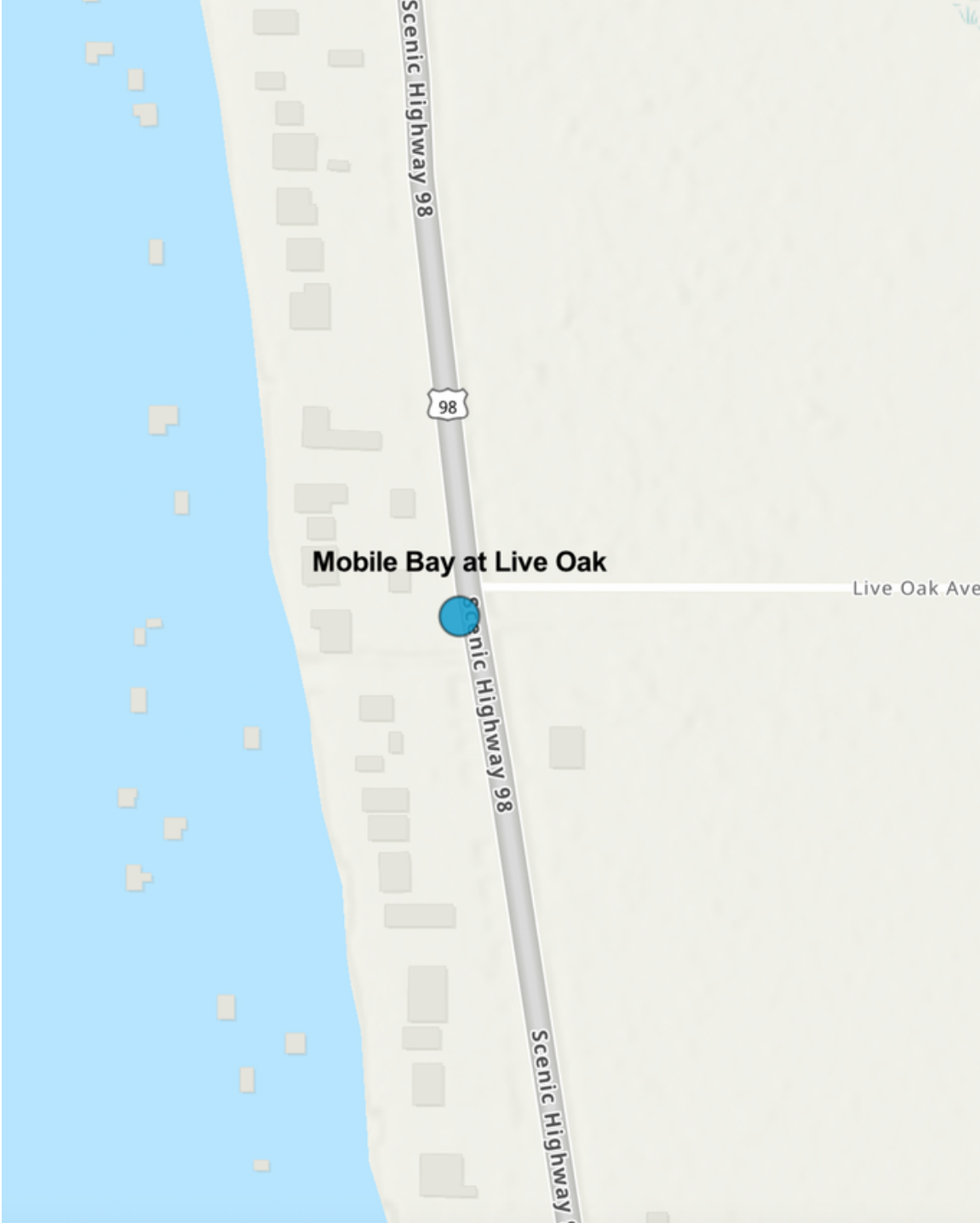
The testing site in Mobile Bay at "Live Oak" is located near the blue circle.