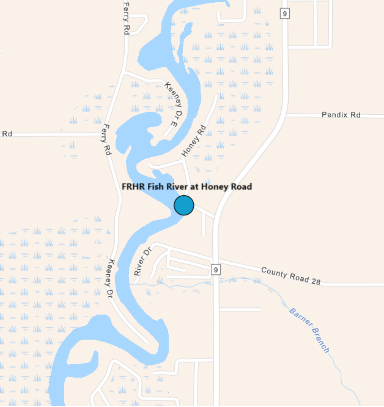
The testing site in Fish River at "Honey Road" is located near the blue circle.